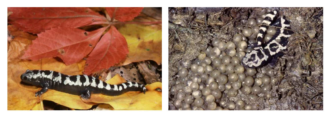
Marbled Salamander.

Like a teenager waiting in line for tickets to a concert, the marbled salamander ( Ambystoma opacum ) actually arrives at vernal pools in the fall, often before the pools begin to refill with rainwater. This gives their larvae a head start to grow over the winter before the other amphibians move to pools in late winter. It also means they are large enough to eat the newly hatched larvae of other salamanders and frogs, as well as vernal pool invertebrates.