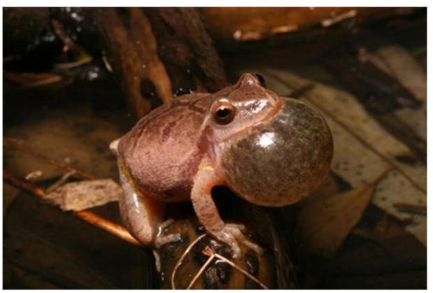
Calling male spring peeper: Photo credit: Charlie Eichelberger

Once the party is over, the adult salamanders and frogs will melt back into the surrounding forests, though most don't move more that a few hundred yards from the vernal pools they were born in. This makes the management and protection of the uplands around these pools just as important as the pools themselves.