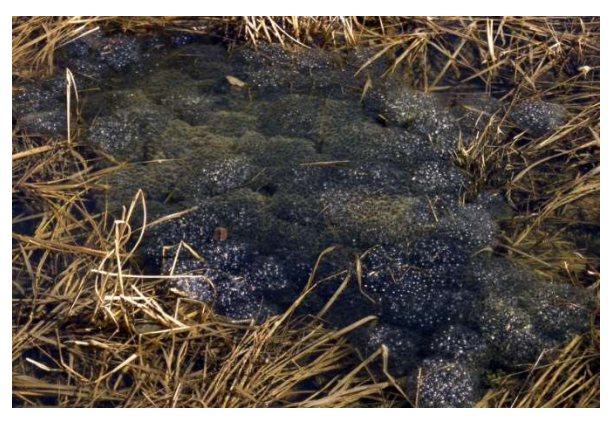
Raft of wood frog egg masses.