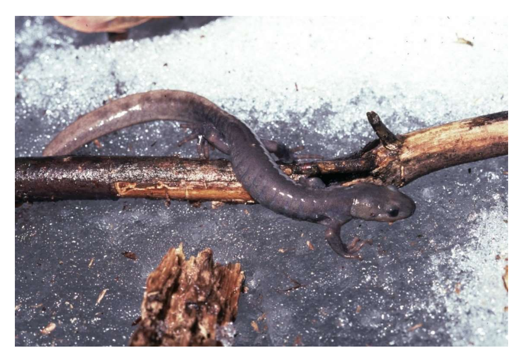
Jefferson Salamander migrating to a vernal pool in late winter over ice and snow.

Over the next several weeks they will be followed by waves of migrating amphibians, including spotted salamanders, spring peepers, wood frogs, gray tree frogs, western chorus frogs, cricket frogs, pickerel frogs, northern leopard frogs, green frogs, spade foot toads, American toads and even bullfrogs! A large vernal pool may become the temporary home to thousands of breeding salamanders and frogs for several weeks, with the resulting din of calling frogs and toads almost deafening (link to a <u>very</u> loud "chorus" from a NY vernal pool: <u>https://www.youtube.com/watch?v=5UfRr52_7s4</u>). By late April, the only sign of the wild party is hundreds of egg masses, quietly developing and getting ready to hatch out.