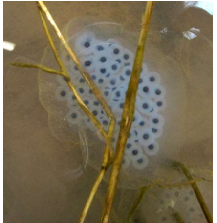
Spotted salamander.