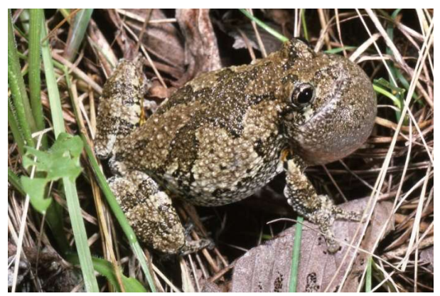
Calling male gray tree frog.