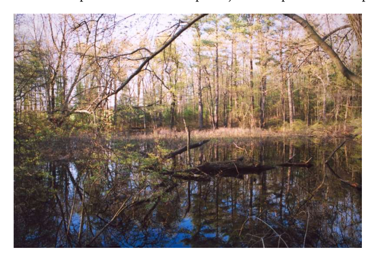
Large vernal pool surrounded by forest.

Once the party is over, the adult salamanders and frogs will melt back into the surrounding forests, though most don't move more that a few hundred yards from the vernal pools they were born in. This makes the management and protection of the uplands around these pools just as important as the pools themselves.